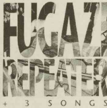
Fugazi is a band worth checking out!