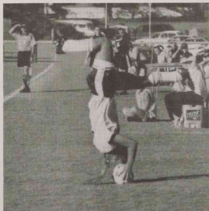
It's all about balance!