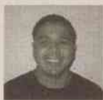
WILL MONTOYA Staff Writer

The 19 th Hole celebrated its Re-grand opening with music and giveaways last Thursday.