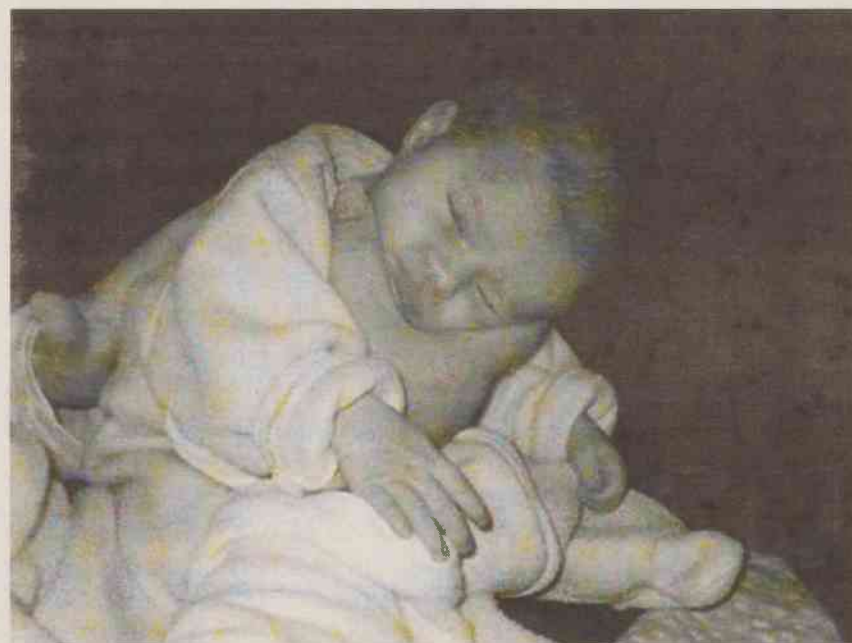
Midnight feedings and little teeny babies to care for can be hard on any couple that is prepared or not.

each other. For me, the best decision would be an open adoption because I would want the comfort of knowing my child is placed in a good home. I'm not saying this is the best decision for anyone else but for me this option seems the most logical.