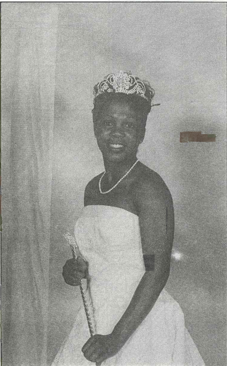
Miss St. Aug.'s poses for a picture.