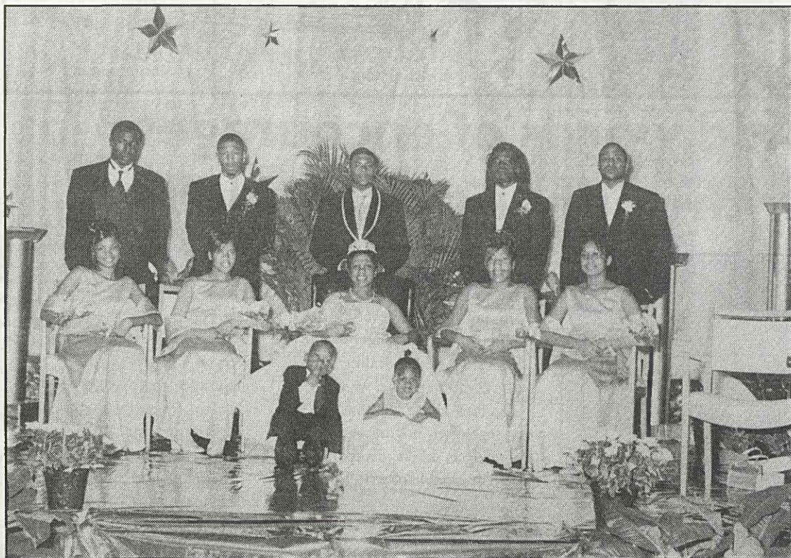
Miss St. Aug.'s and her court take a minute to pose on the wonderfully decorated stage, fulfilling a night of dreams.