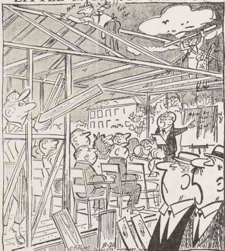
"THERE ALWAYS SEEMS TO BE THIS INFERNAL LAG BETWEEN OUR INCREASED ENROLLMENT AND OUR BUILDING PROGRAM."

THE NASHVILLE GRAPHIC Nash County's First Newspaper PUBLISHERS — PRINTERS PHOTOGRAPHERS