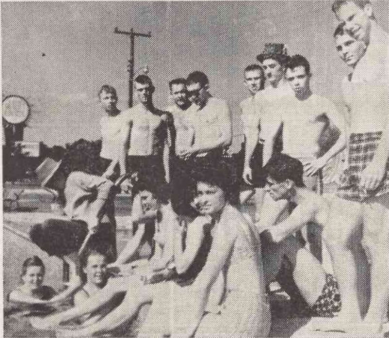
SWIMMERS ENJOYING POOL