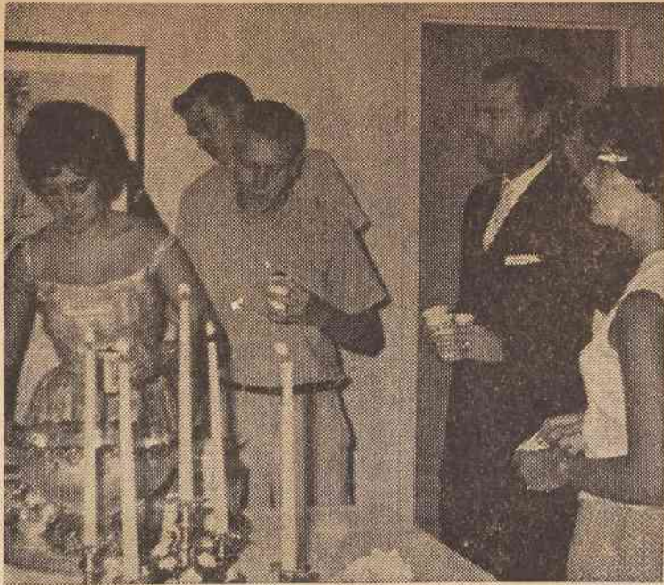
PUNCH IS SERVED FOLLOWING ORIENTATION PROGRAM