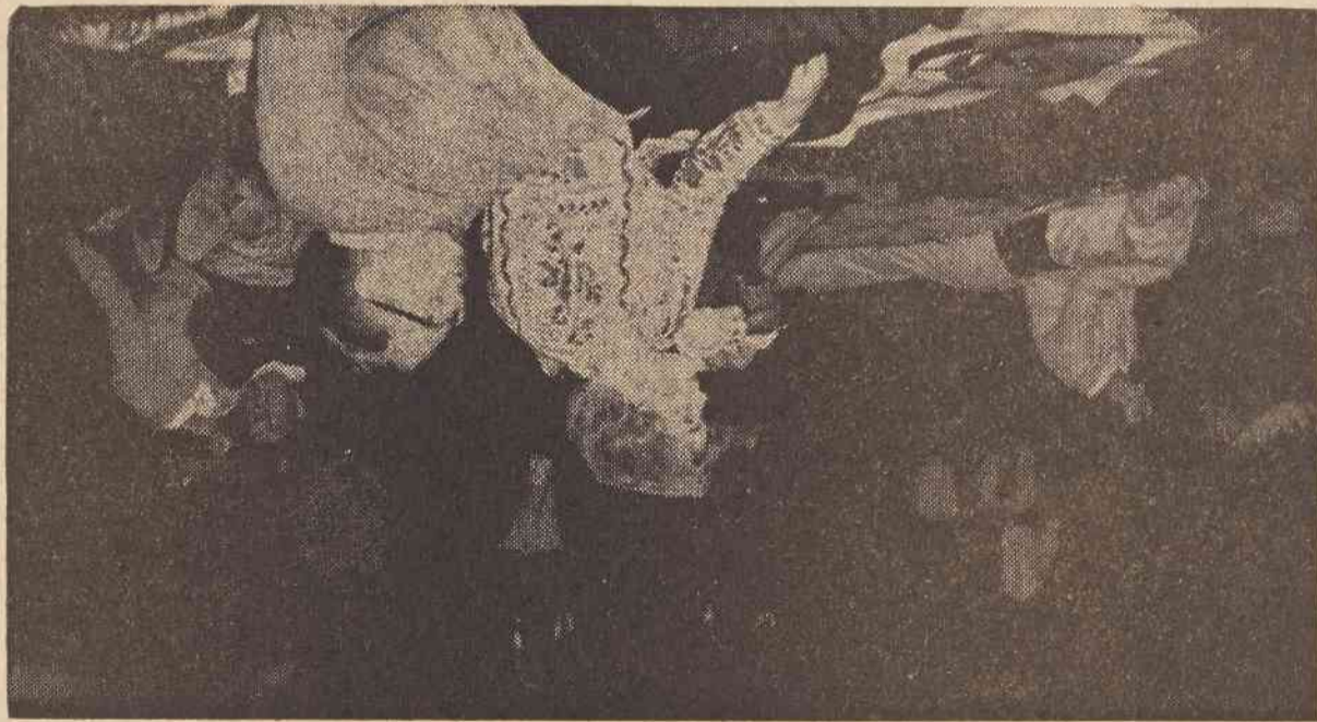
THE SHEEP MINGLE IN REVERENT STUDY

Social reforms finally came and now it looks like the lambs and shepherds will live happily ever after. Isn't this how all fairy tales end?