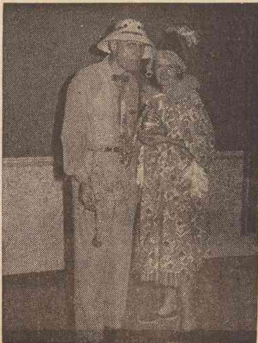
TYPICAL SHEEP HERDERS