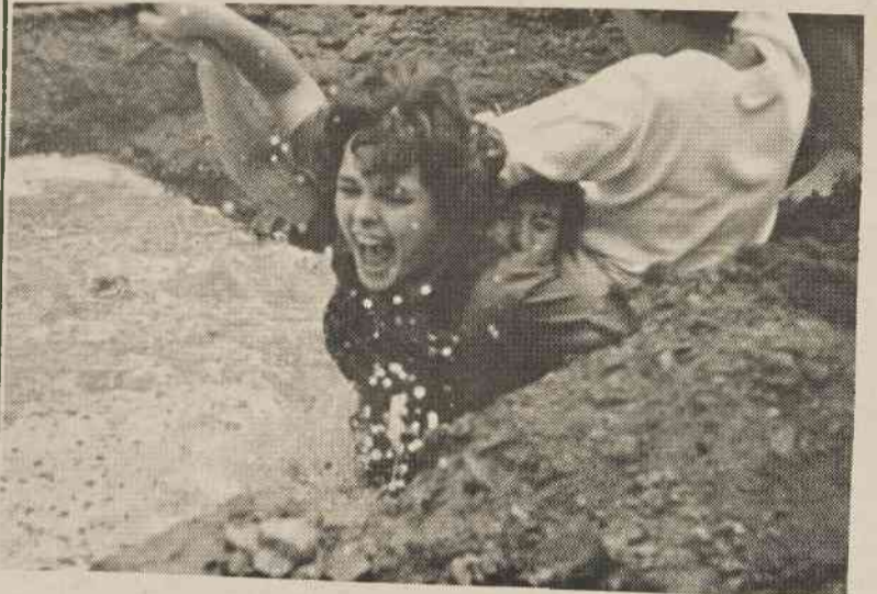
Freshmen are dragged into the pit during the Tug-of-War. This Field Day.

One of the best contests of the day was the touch football game. Early in the game, both teams tried their running attack but because of a muddy field