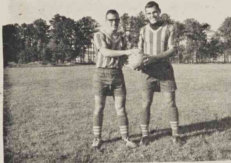
Wesleyan Soccer Team

The victorious team received a roaring welcome from the student body upon their arrival on the campus.