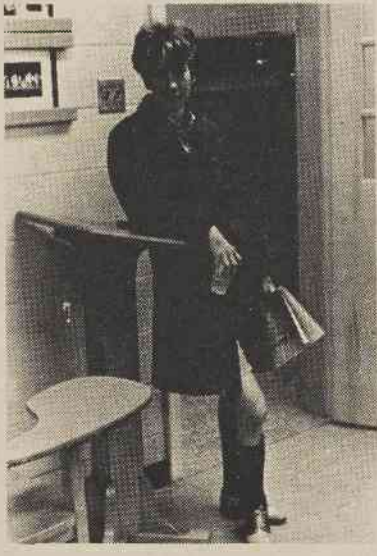
What type of woman reads the Decree?