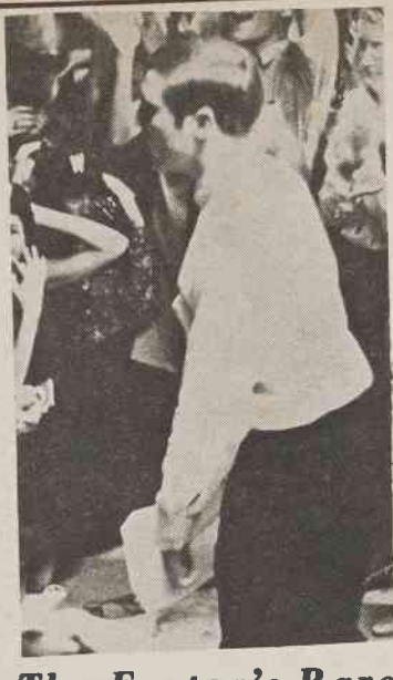
The Factor's Rare

The factor's rare That forms such love, That is the lens Can make a rainbow, End and all.