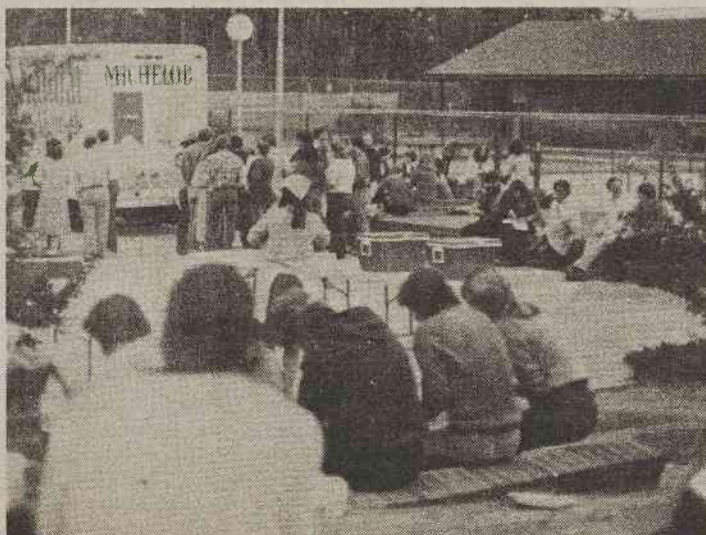
Students and faculty "pig out" at Northgreen County Club on Homecoming weekend.