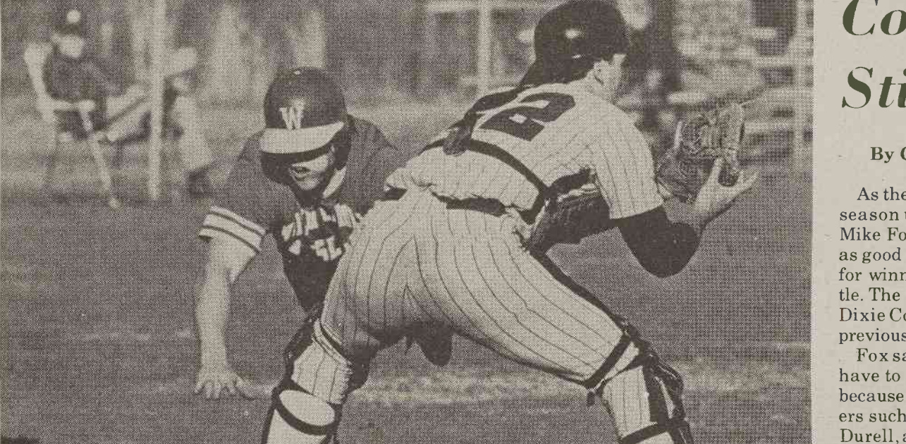
BATTLING BISHOPS LOSE STRENGTH BUT NOT HOPES FOR TITLE

The women, who finished the season with a 16-12 record, did not receive an at-large bid to the NCAA tournament. The men ended their season similary, as they did not get a bid despite a 21-7 record.