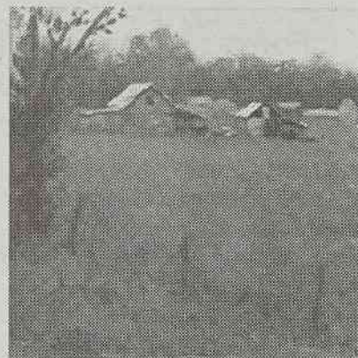
Jimmy Womble: New Paintings / Old Locales