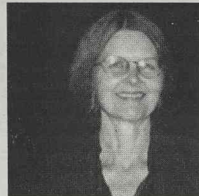
Faculty Adviser to The Decree:

If you are interested in any of the above listed positions, or if you would like to be a part of the Decree staff in any other capacity, please contact the Editor-in-Chief.