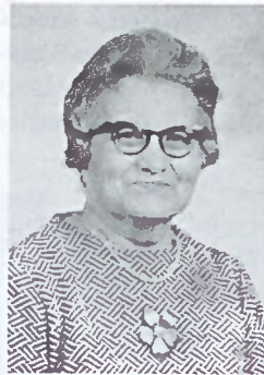
Virginia Flowers Hosiery Division Hickory December 14, 1948