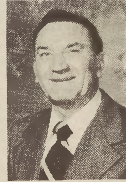
John Stilwell Machine Shop