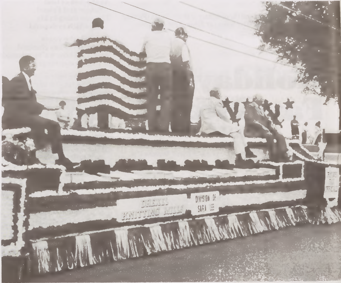
Drexel Knitting Millis helped to celebrate the 50th Anniversary of the Drexel Community Fair earlier this year by entering a float in the parade.