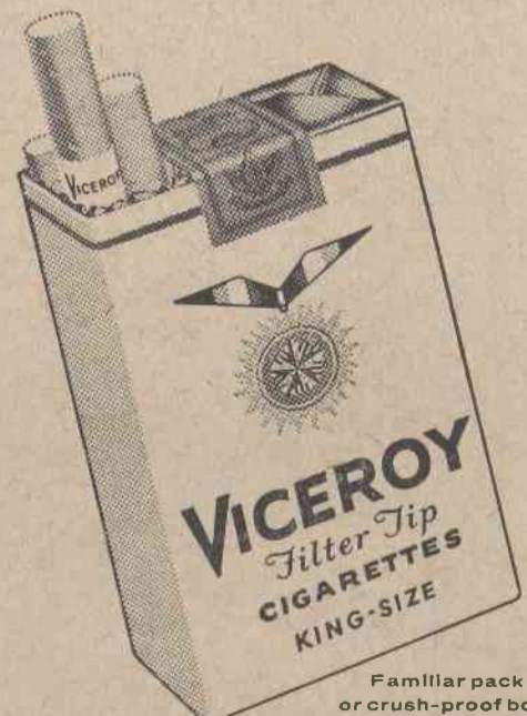
Familiar pack or crush-proof box.

*If you have checked (C) in three out of four questions, you're pretty sharp . . . but if you picked (B), you think for yourself!