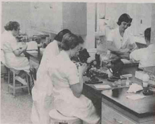
1,022,527 Laboratory Tests