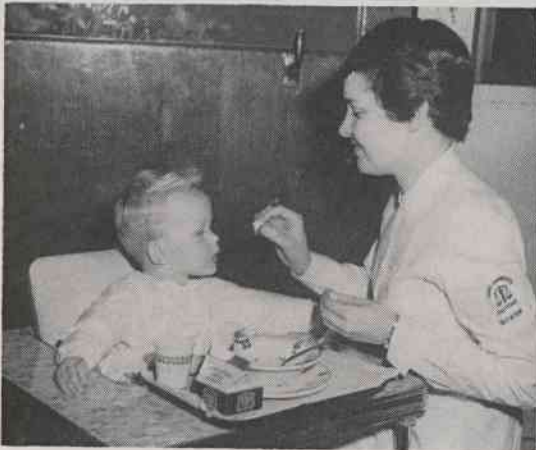
530,352 Patient Meals