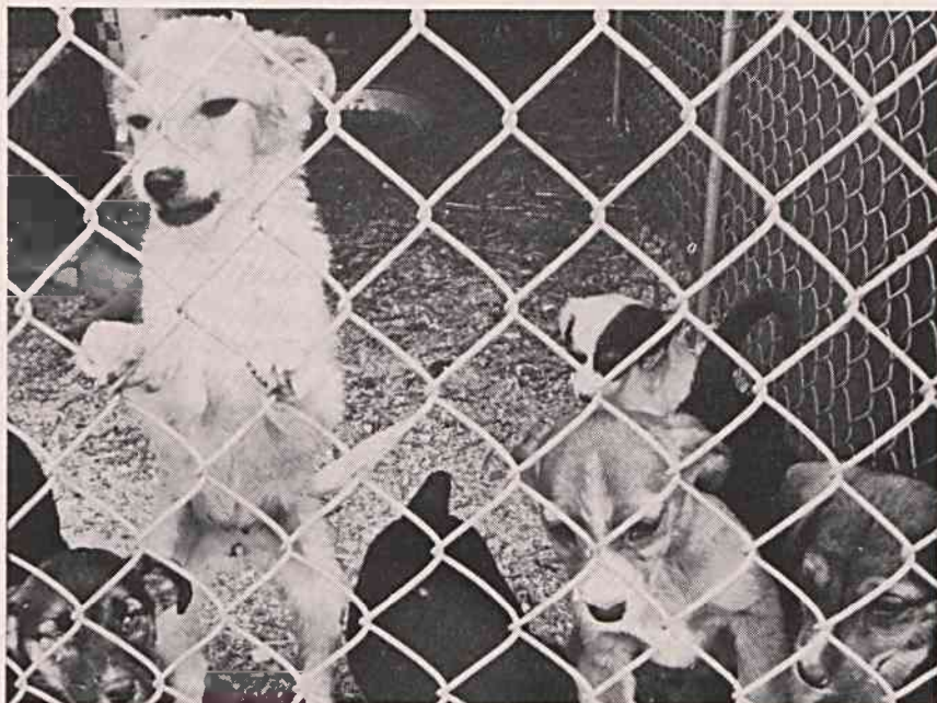
"A dog responds to the care and treatment he receives . . ."