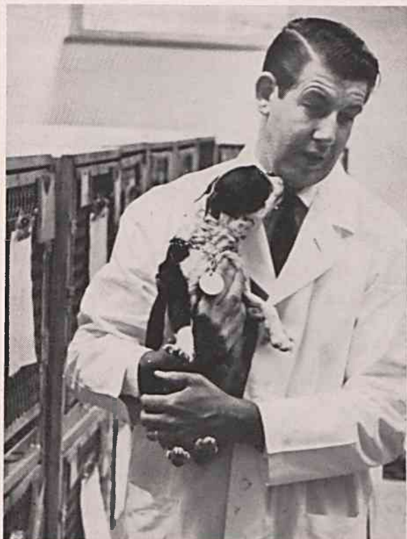
After two or three days health and dispositions improve.