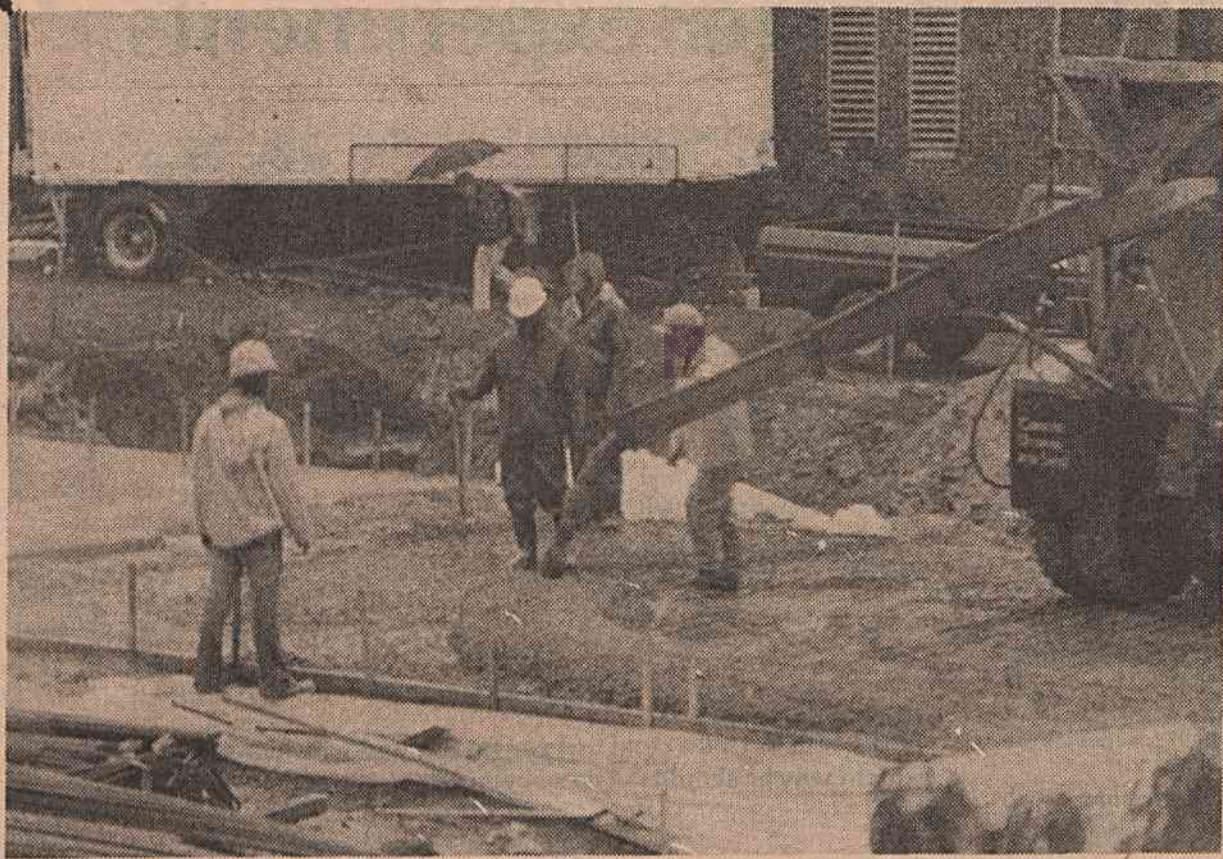
NEITHER RAIN, NOR... — Workmen were undisturbed by the rain late last week as they poured concrete for the PRT (Personal Rapid Transit) track, between the Bell and Mudd Buildings. The PRT will link Duke Hospital North and Duke Hospital South, and people going from one to the other will be undisturbed by rain or other inclement weather which might be around at the time.