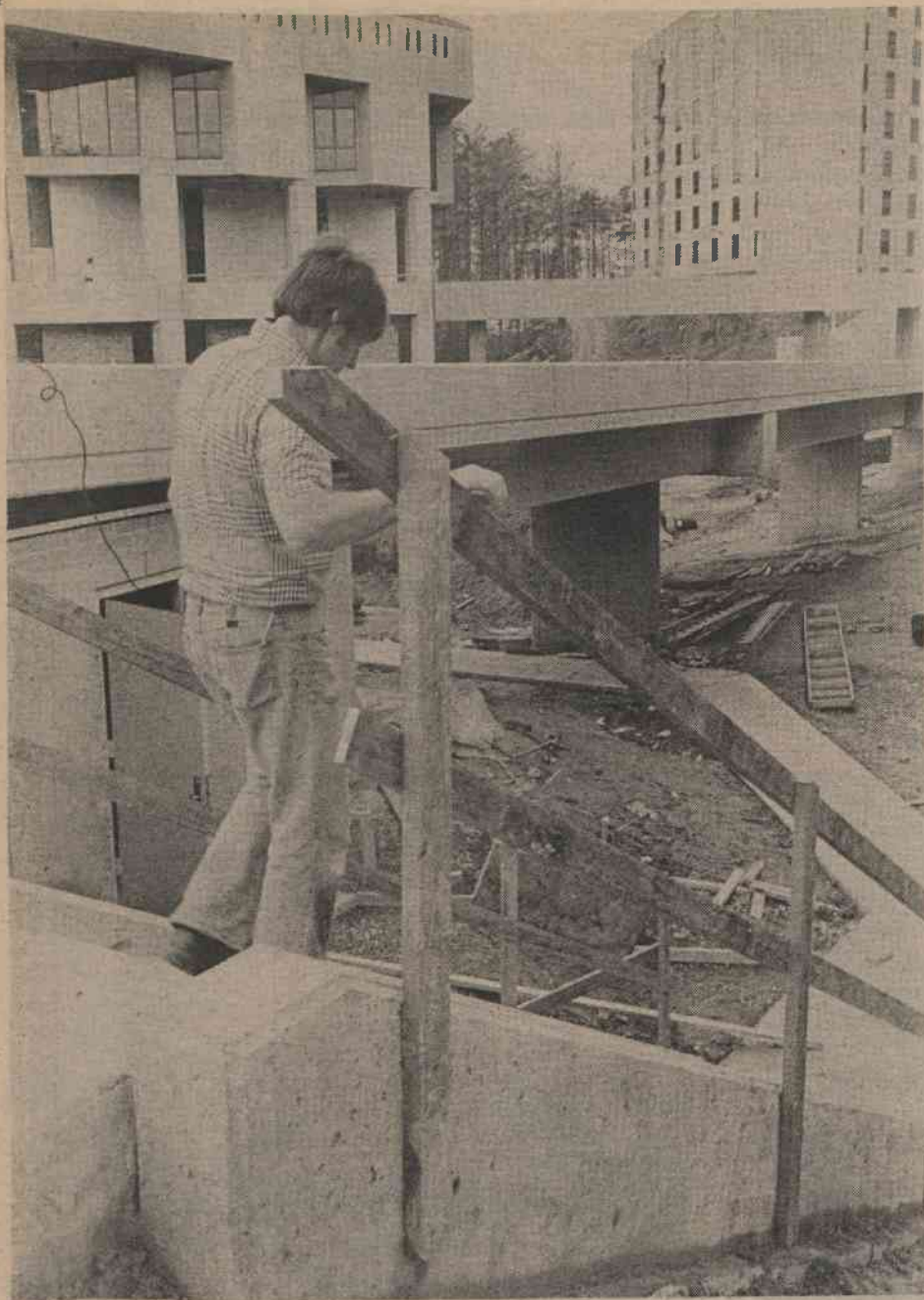
NEW ROUTE —If you wondered how to get from the Bell Building to the Mudd Building (at left) after the PRT went into operation, wonder no longer. These steps are part of a newly-poured concrete walkway which goes under the PRT guideway. The temporary wooden handrails eventually will be replaced with permanent handrails. Duke Hospital North's bedtowers are partially visible in the background.