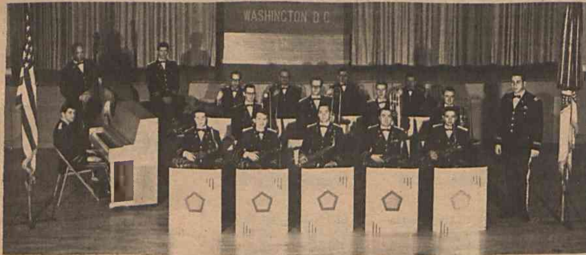
The "Kings of the Road"