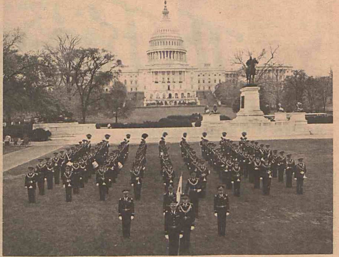
U.S. Army Field Band in front of the nation's capitol in Washington, D. C.