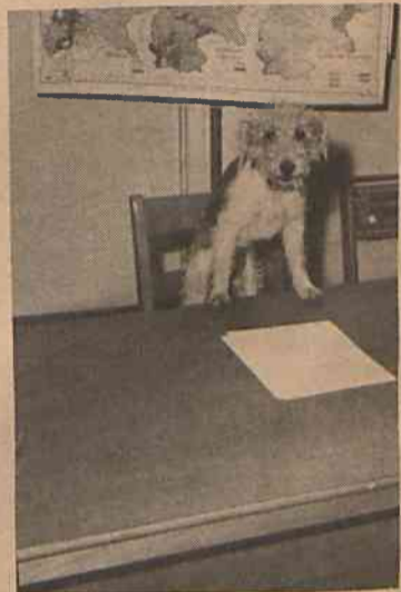
"Now, as I was saying. . ."