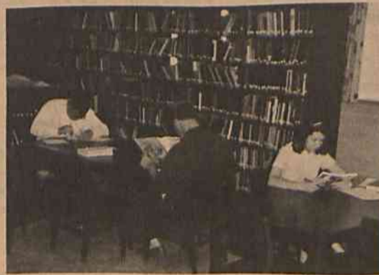
A Day In The Library.