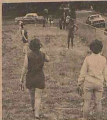
The girls' 1:40 P. E. class learns what to do with horseshoes.