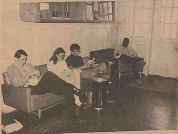
Time between classes in one of the two Student Centers.