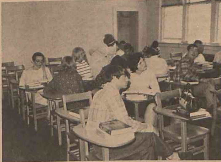
English - just before Miss Pearson arrives.