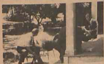
Lunch in the faculty lounge.