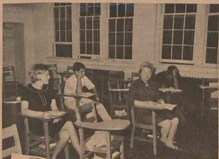
The day ends with a night Spanish class.