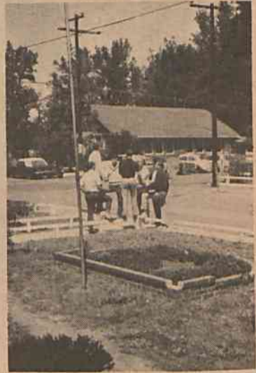
This is the way we pass our time between classes.