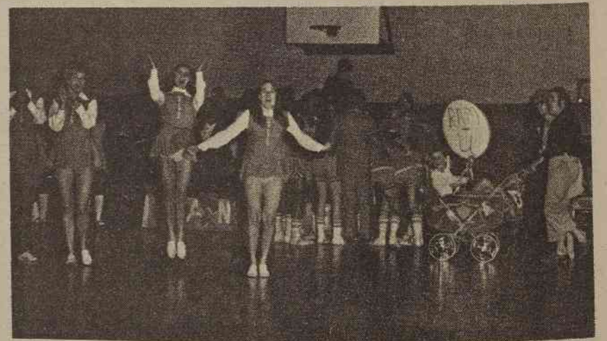
Right on! Cheerleaders