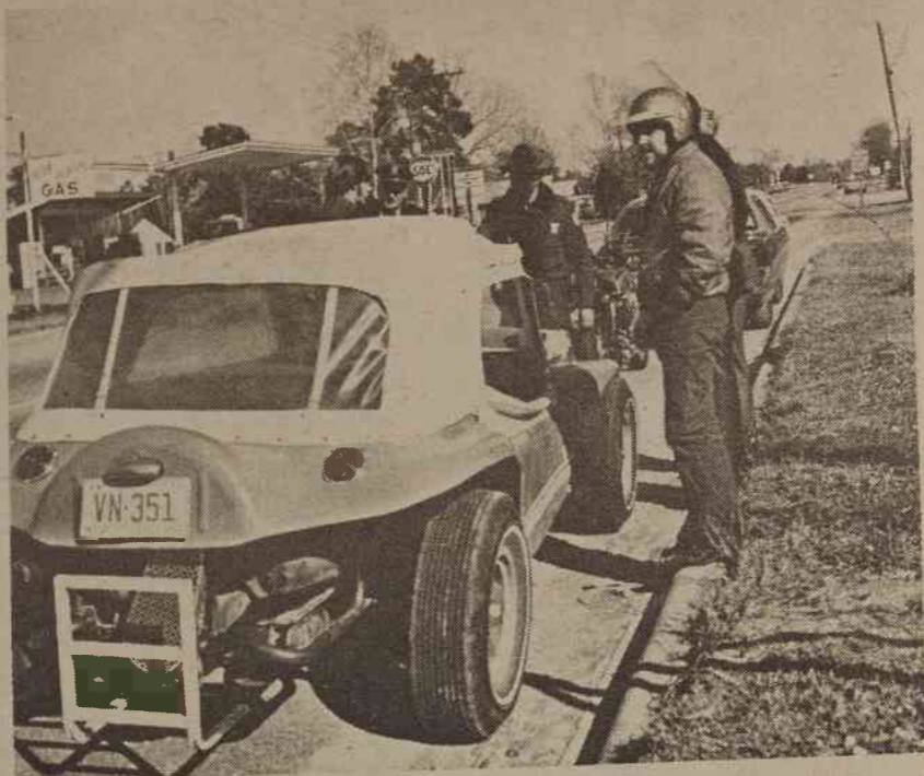
What's a parade permit?