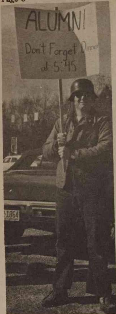
The galloping gourmet