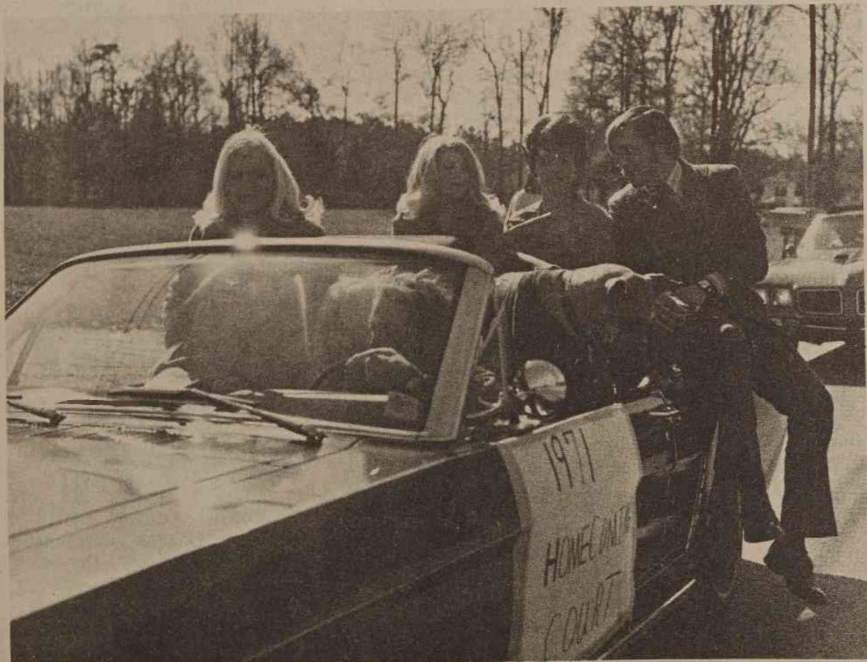
You ole dog!

HOMECOMING Southeastern Community College held its second annual Homecoming Saturday, January 16, 1971. It consisted of a "Ramacade", an open house, the alumni dinner, and the basketball game between SCC and Lenoir Community College.