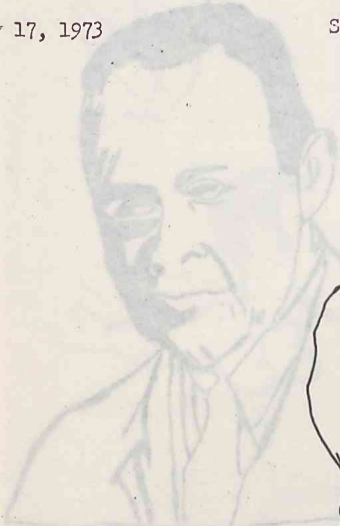
DR. CHARLES DREW 1902-1950 Blood Plasma Researcher