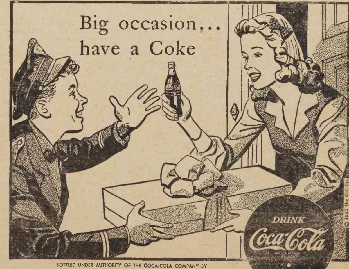
Burlington Coca-Cola Bottling Co., Burlington, N. C.