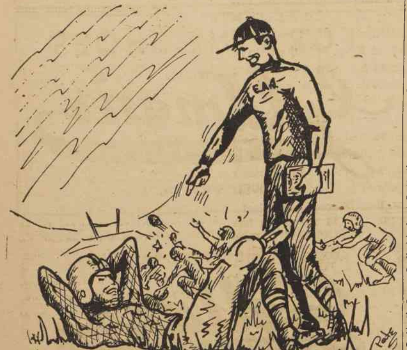
What, may I ask, are you doing? I'm practicing time-out, coach!