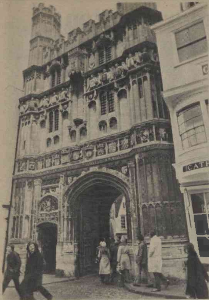
Elon College students walk through ancient gateway in Canterbury to visit the Cathedral where Thomas Becket, archbishop, was murdered in 1170 A.D.