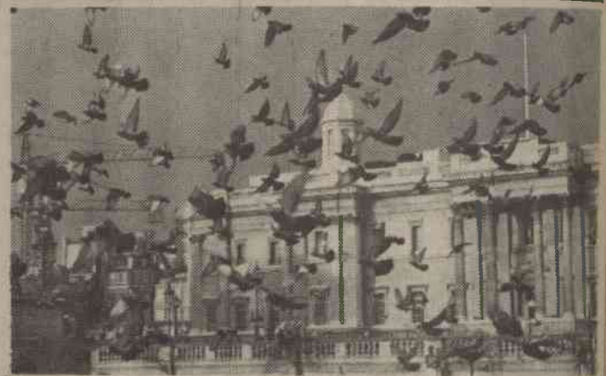
The pigeons of Trafalgar Square flutter up in front of the National Art Gallery in London.