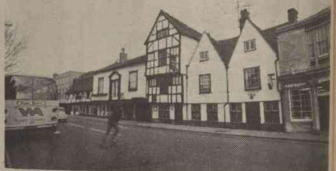
Stratford-upon-Avon, birthplace of Shakespeare, was popular with the students who came by coach via Oxford.