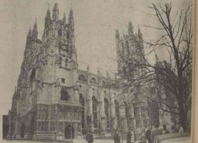
Canterbury Cathedral, built on the spot where St. Augustine reintroduced Christianity in 597 A.D., was visited by students on tour from London.