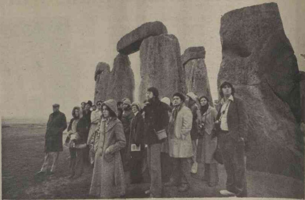
History, political science, English, and music students with professors visited Stonehenge on a chilly January afternoon.