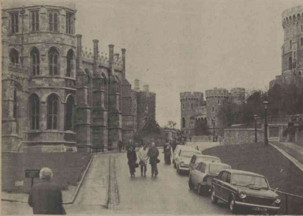
Royal Windsor Castle, largest in Europe, is a home of the Queen of England and a great tourist attraction. Students toured the State Apartments.