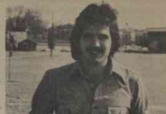
some of the night spots in Burlington and Chapel Hill."