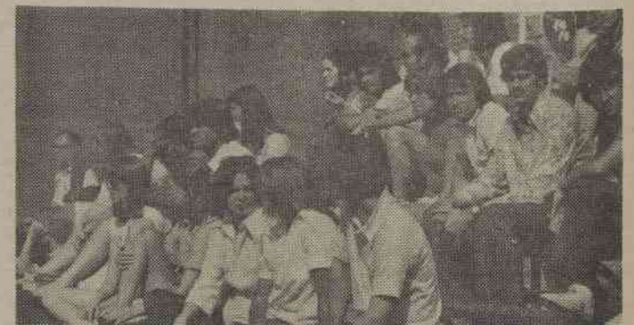
An enthusiastic and warm crowd gathered for the first match of the 1976 tennis season.

You'll also want to get into shape for the upcoming Putt-Putt Tournament sponsored by Alpha Phi Omega service fraternity. The date is Thursday, April 22. Watch for details in the next issue of the Pendulum.