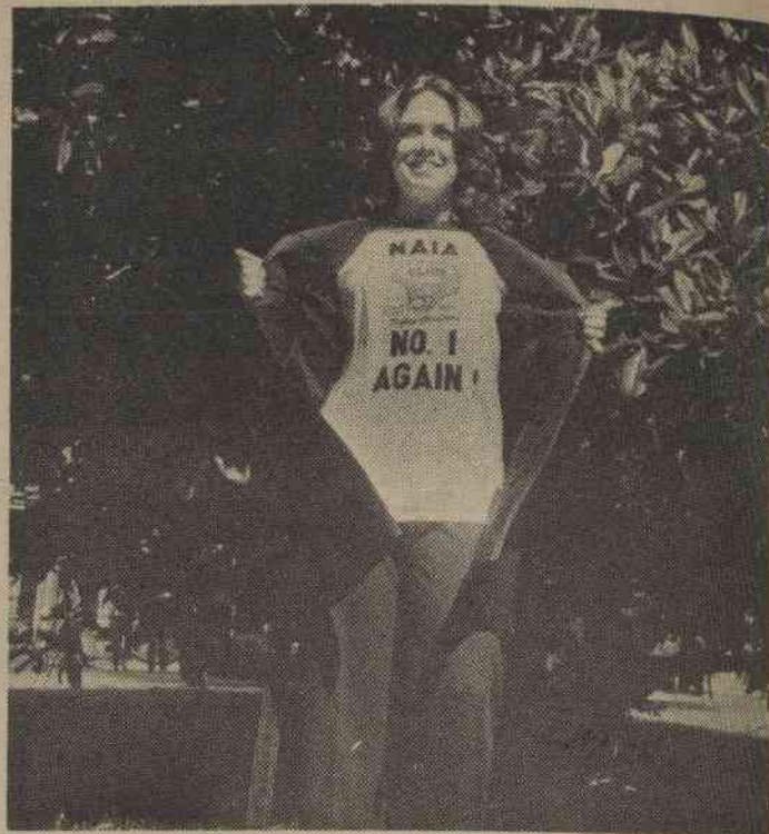
Could 1976 be a repeat of the '73 season?

Elon 1-0-0 in the SAC-8 and 4-0 overall, will meet Wofford at Burlington this week for a homecoming game. Elon hosts Presbyterian the following week in a SAC-8 encounter in Burlington. Time is 2 p.m. for Elon and Wofford.