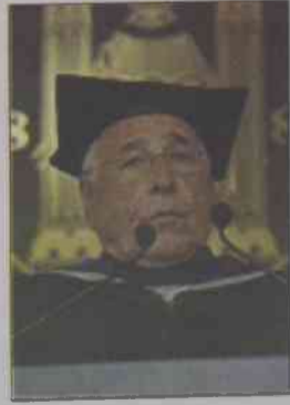
2006 Jack McKeon Former Florida Marlins Manager