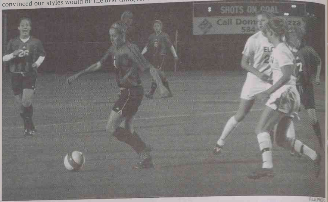
The Elon women's soccer team saw an early exit from the SoCon tournament last season at the hands of UNCG. This season, under new guidance and with what they say is increased motivation and dedication, the Phoenix hopes to climb the SoCon standings for a higher finish.