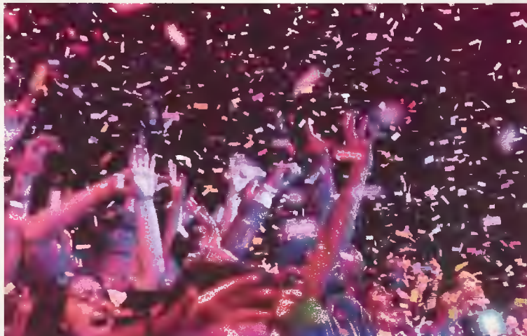
Matt and Kim threw confetti, balloons and inflatable sea creatures into the audience.