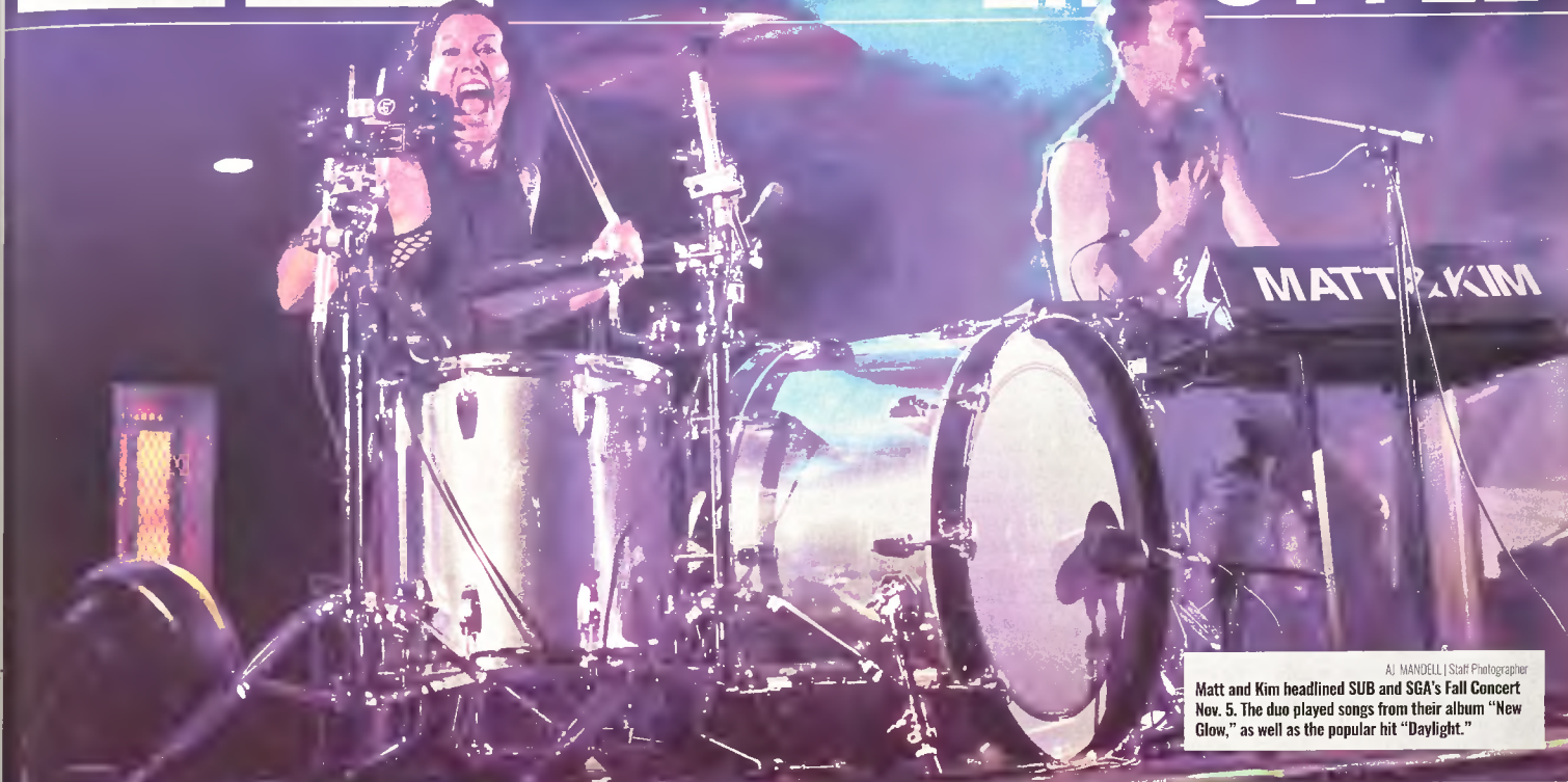
Matt and Kim headlined SUB and SGA's Fall Concert Nov. 5. The duo played songs from their album "New Glow," as well as the popular hit "Daylight."