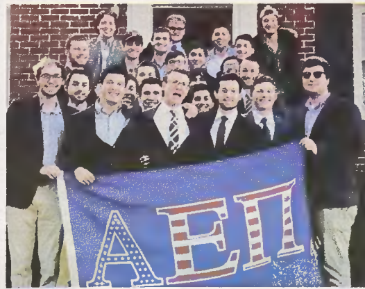
Alpha Epsilon Pi celebrates the initiation of the Alpha class this past weekend.

decided it was time for Elon to become one of more than 300 universities around the world with an AEPi chapter or colony. Elon's group, which now has just under 30 members, is considered a colony rather than a chapter because it has yet to gain recognition by the university.