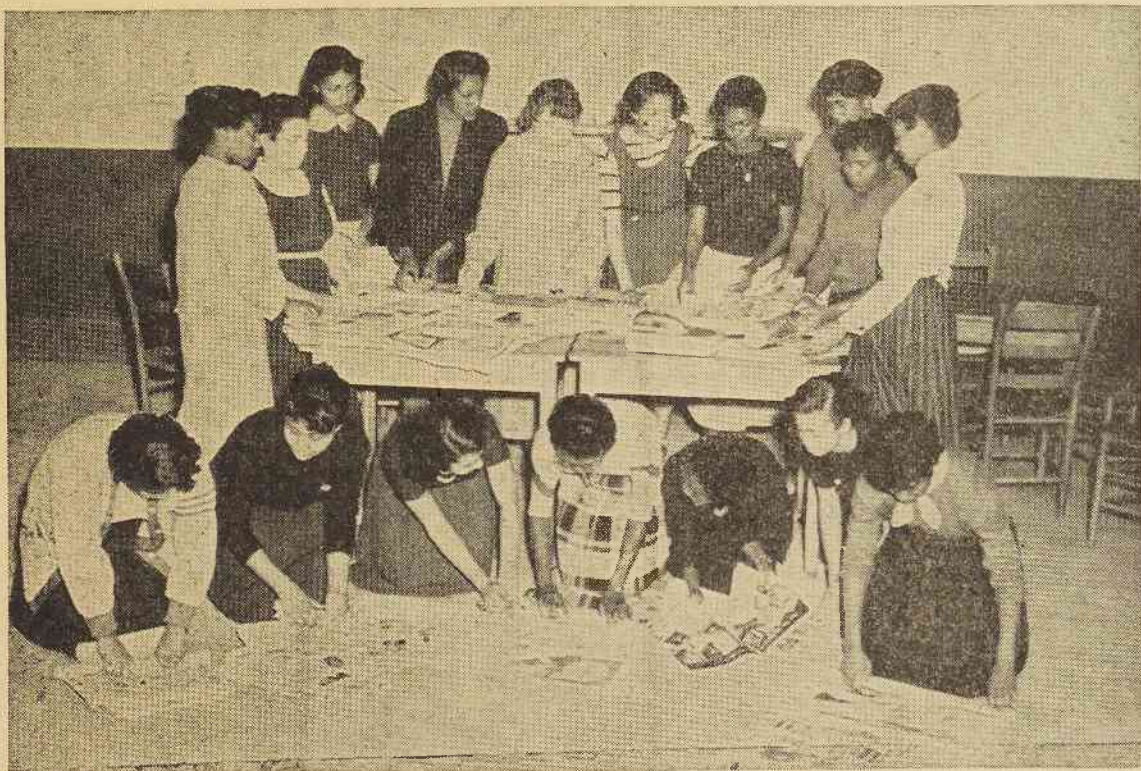
THESE ENERGETIC Y.W.C.A. members are working on one of their projects | The proceeds from this paper collection project will go to the Fuller School for Exceptional Children.