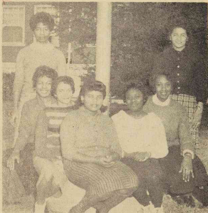
Caught by the shutterbug were these pretty officers of Bickett Hall Dormitory Association.