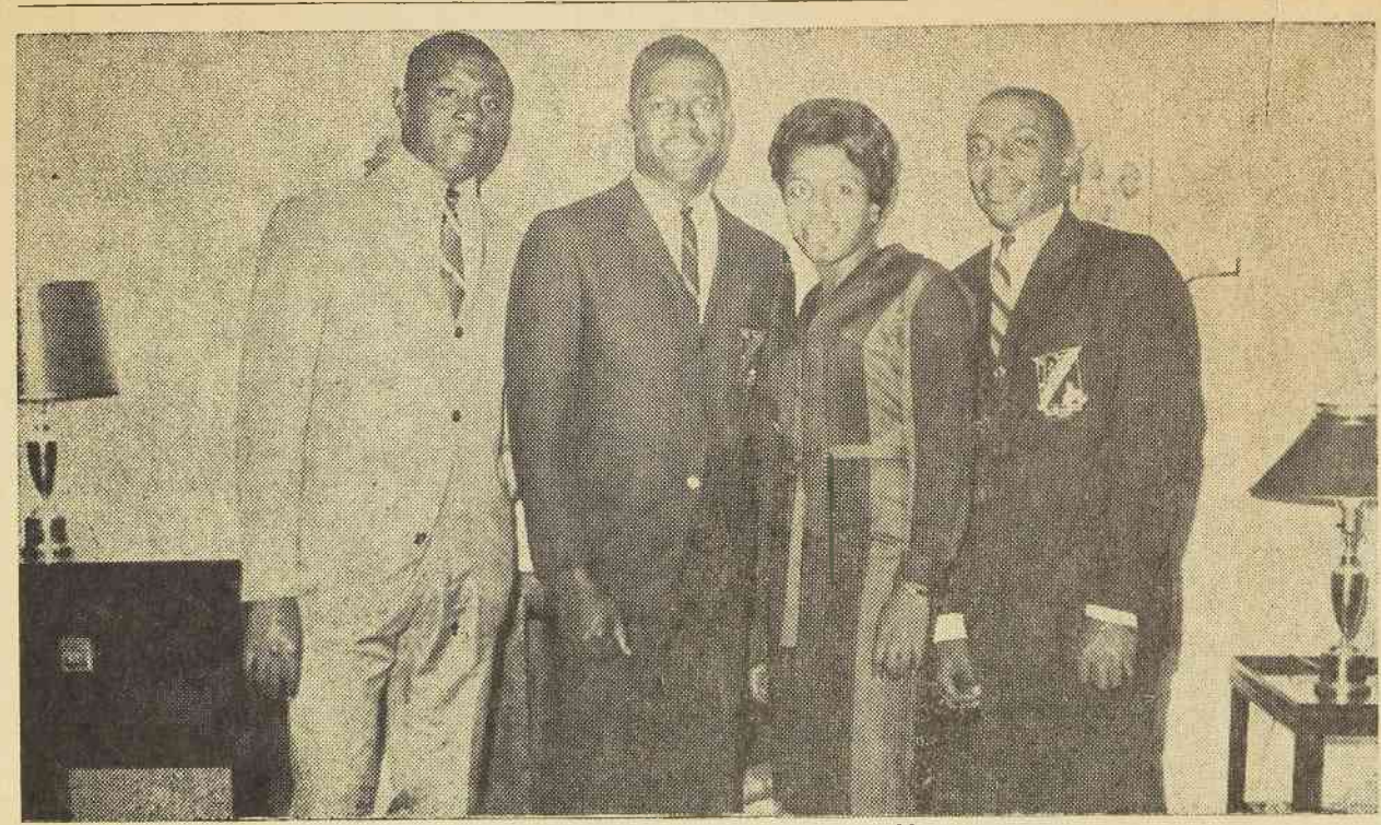
Student Government Officers