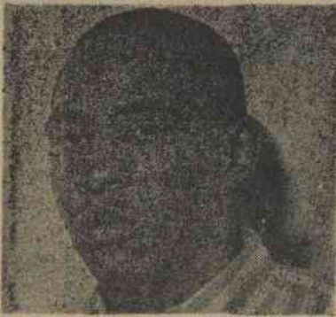
Sportshorts with "OTT"