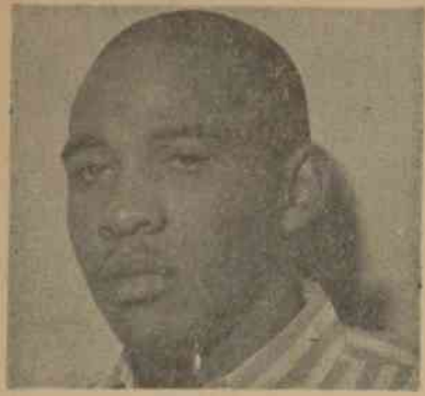
Sportshorts with "OTT"