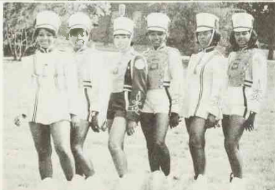
THE WHOLE SQUAD