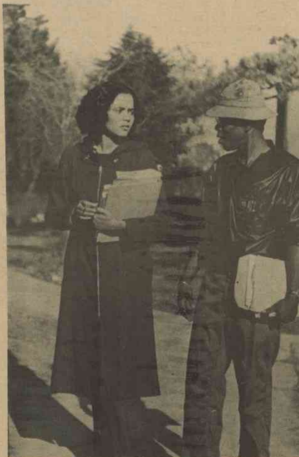
STOP LYING, LINC!!!