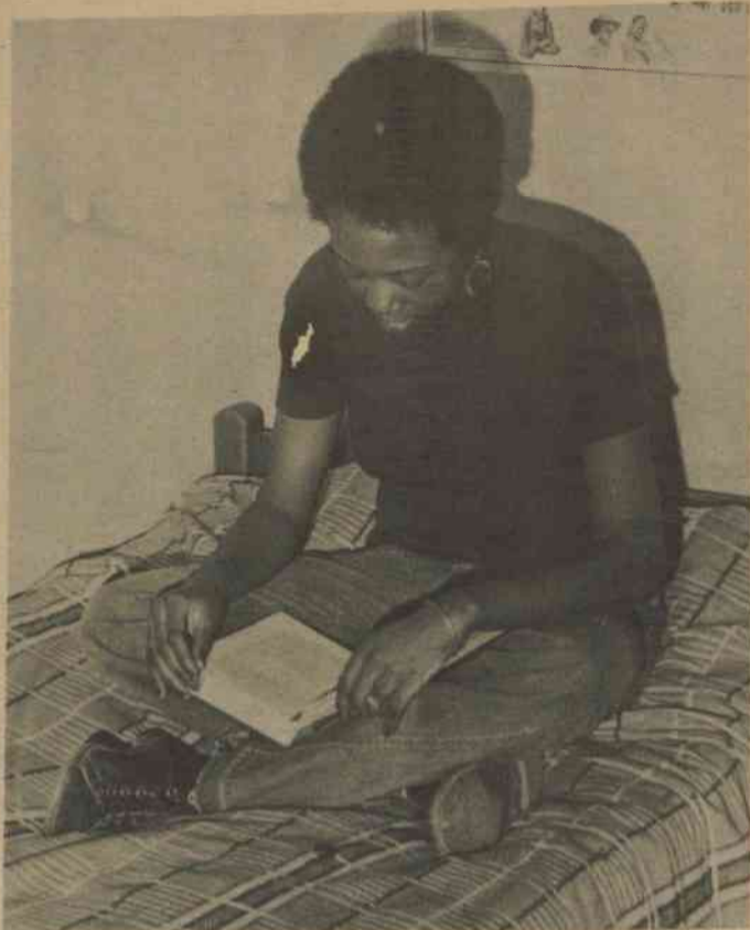
HANG IT UP, BUFF, IT'S TOO LATE NOW!