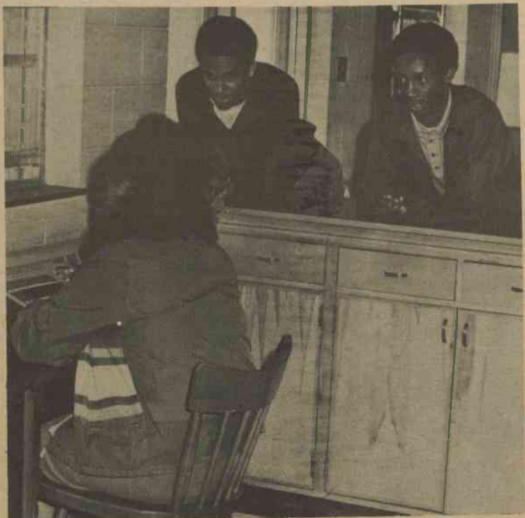
AW, COME ON, what my girl don't know won't hurt her.