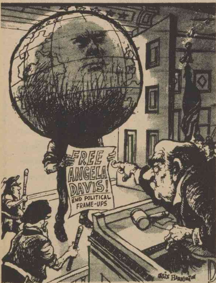
"Gag and handcuff that witness!"

This is the first of a series of first hand articles on the trial of Angela Davis to appear in the Voice. The writers are members of the College Voice, a Palo Alto, California based student staff that is covering the trial from a student's perspective. The Voice is the only paper in North Carolina receiving this service.