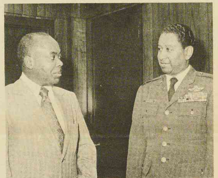
COMMANDANT VISITS FSU AIR FORCE ROTC UNIT--

For a copy of a new booklet "The Cold Mystique" write to: Calgon Consumer Products Company, Inc., Box 1467, Pittsburgh, Pa. 15230.