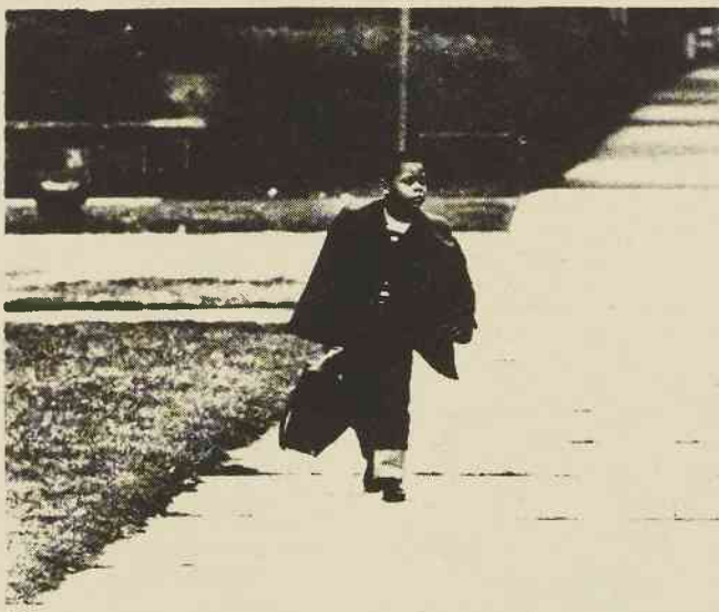
It's out there and I'm going to get it.

He went on to state that legalized prostitution would cut crime, reduce the spread of venereal disease, curb police corruption, and relieve court overcrowding.