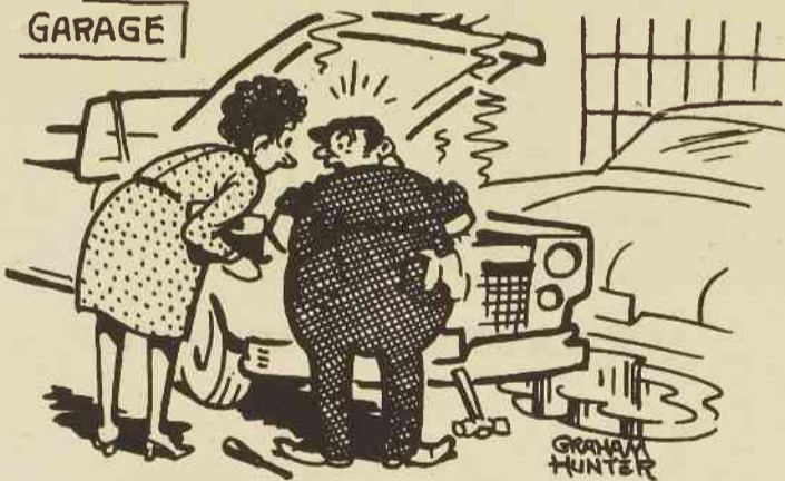
"Just a minute, Mrs. Peermore — does someone peek over YOUR shoulder when you're putting a cake together?"

May each new day be a bright page in the book of happiness.