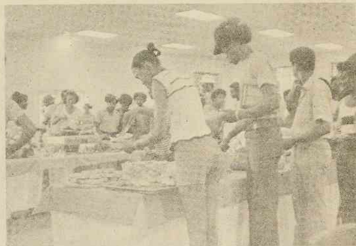
IT'S TIME TO EAT: On this particular day the Broncos believe that their dream of delicious food in Cook Dining Hall has become a reality. Has it?